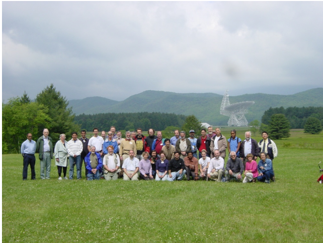
Green Bank, WV, USA June, 2002