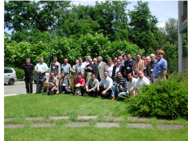
Castel San Pietro, Italy June, 2005